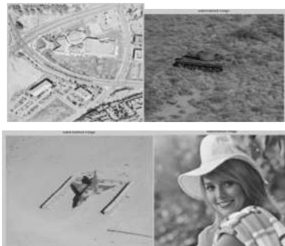
Fig-3 Watermarked image (a) Pentagon (b) War tank(c) Aircraft (d) Girl

After embedding the watermark in to the reference image watermarked image obtained. Watermark hidden in the reference image is robust not degraded the quality of real image. Watermarked image looks like reference image means watermark is imperceptible here. Image quality is determined by calculating PSNR after comparing the real image with the watermarked image.