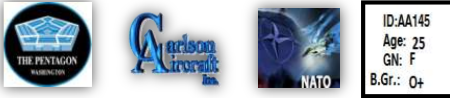
Fig -2 Watermark image (a) Pentagon logo (b) Aircraft company logo (c) Nato logo (d) Identity details logo

These images are used to embed in the reference image for security purpose.