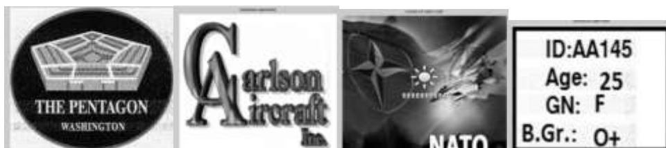
Fig-4 Extracted Watermark (a) Pentagon logo (b) Aircraft company logo (c) Nato logo (d) Identity details logo

Finally watermark extracted from real image and that watermark compare with the real one to detect any attack and by this comparison we obtain the normalised correlation coefficient (NCC) Calculating NCC we detect the robustness of watermark.