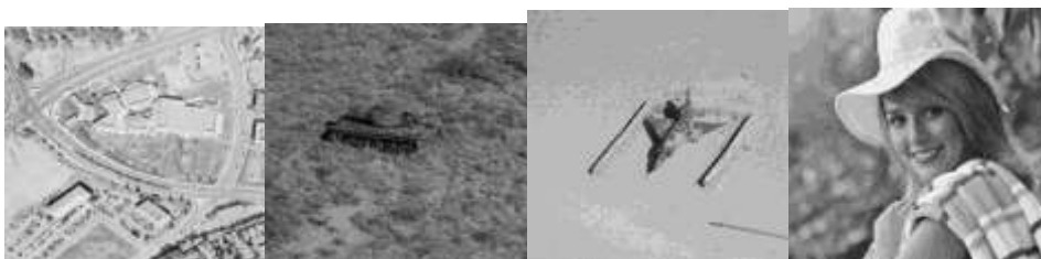
Fig-1 Reference image (a) Pentagon (b) War tank (c) Aircraft (d) Girl

These images are taken to embed the watermark downloaded from standard database. Overall analysis done with the 512x512 image. Here images used that are downloaded from USC-SIPI image database for watermarking algorithms. MATLAB software used for simulation of this technique.